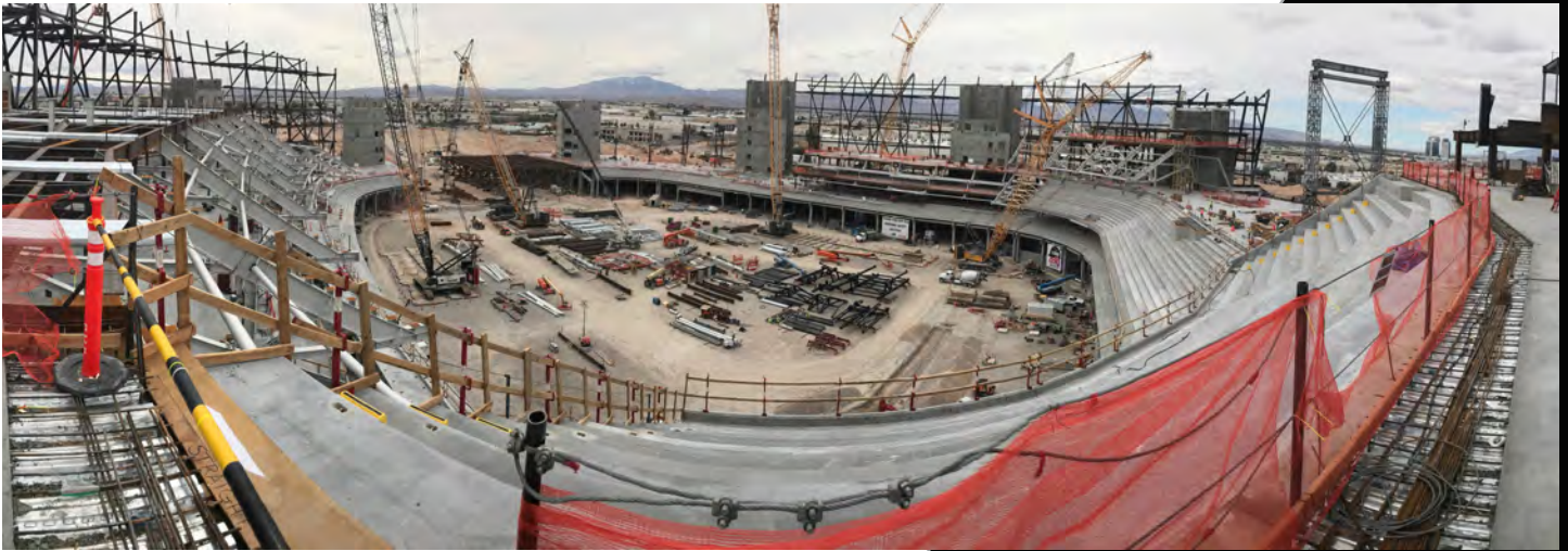
Above: View from 300 level looking Southwest. Below: View from 100 level looking Northeast.