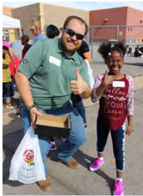
The Mortenson-McCarthy Joint Venture team participated in the Goodie Two Shoes Event